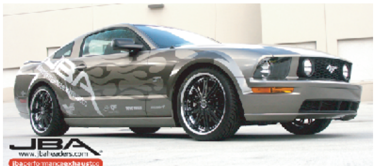
2005 Mustang GT JBA Project Vehicle See more pictures of this car at www.jbaheaders.com