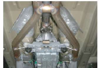
JBA Off-road H-pipe Part No. 6675SH