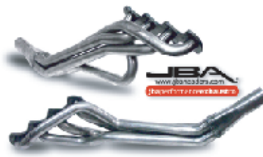
JBA Long Tube Headers Part No. 6675S

JBA also offers long tube headers, shorty headers, and h-pipes for the 05-06 Mustang. For more information about these and other quality performance products from JBA visit www.jbaheaders.com